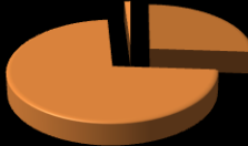
Percentage of Total Living by Race/Ethnicity, 2005